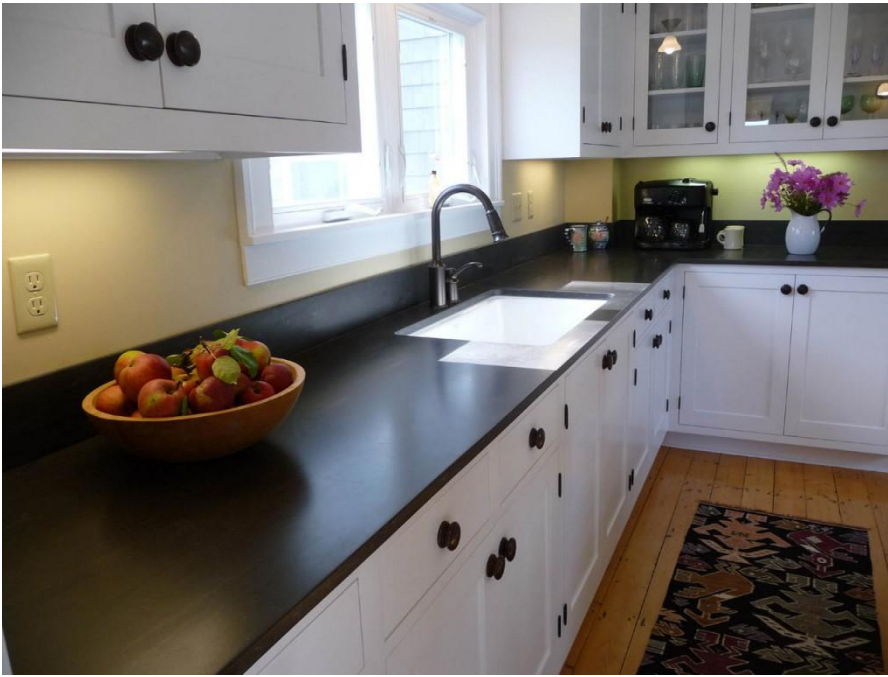
Sink area and counter of home.

The couple is garnering a strong reputation in Maine and Canada for their high-quality, one-of-a-kind kitchens, bathrooms, cabinets and furniture.