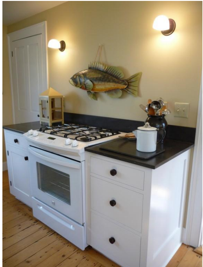
View of stove area where the couple discovered an old fireplace, complete with beehive oven, that had been covered up inside the wall. It was unable to be restored but the new stove wall was outfitted with built in cupboards to flank the stove.

Patrick Mealey and Joyce Jackson’s work can be seen at: www.fineartistmade.com or on their blog, www.fineartistmade.com/blog.php .